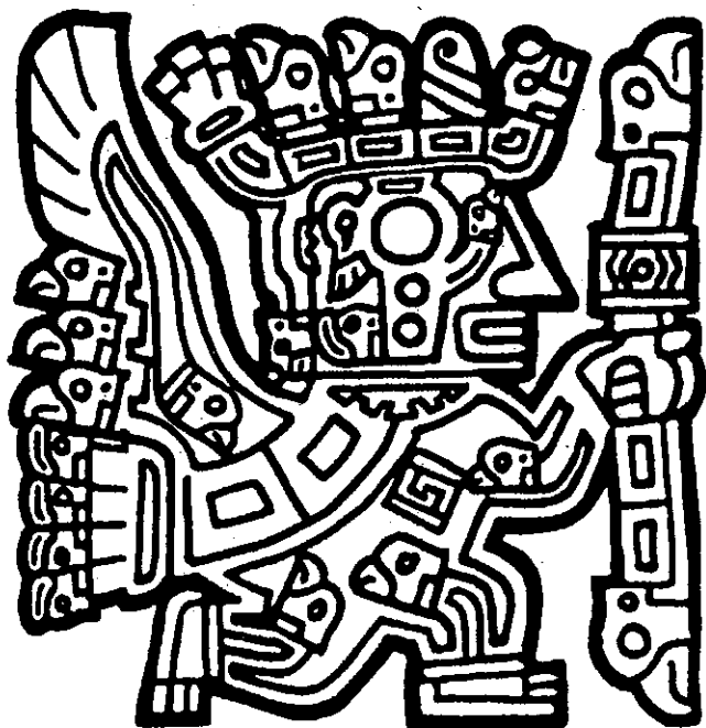
Winged attendants of the thunder god are shown in profile rather than full face. The figures have rayed headdresses and carry staffs.

Some rituals happened inside the temples. The great monthly festivals occurred outdoors. All of the people could take part in them. The celebrations included dancing, feasts, games, songs, and parades. The ceremonies also included sacrifices and offerings. Incas sacrificed animals such as the llama and guinea pigs. At times human sacrifices, including child sacrifices, were part of the rituals.