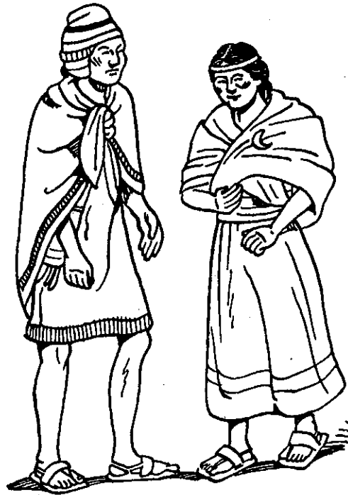
The Incas conquered a vast empire in South America, constructed a 12,000-mile road system, and developed terrace farming and irrigation systems.

The Incan civilization was at its peak when the Spanish arrived. Francisco Pizarro led the Spanish invaders against the Incas. After a series of fierce battles, the Spanish defeated the Incan king, Atahualpa, and in 1533 he was killed. The descendants of the Incas, like those of the Mayas and Aztecs, continued to live under the rule of the Spanish.